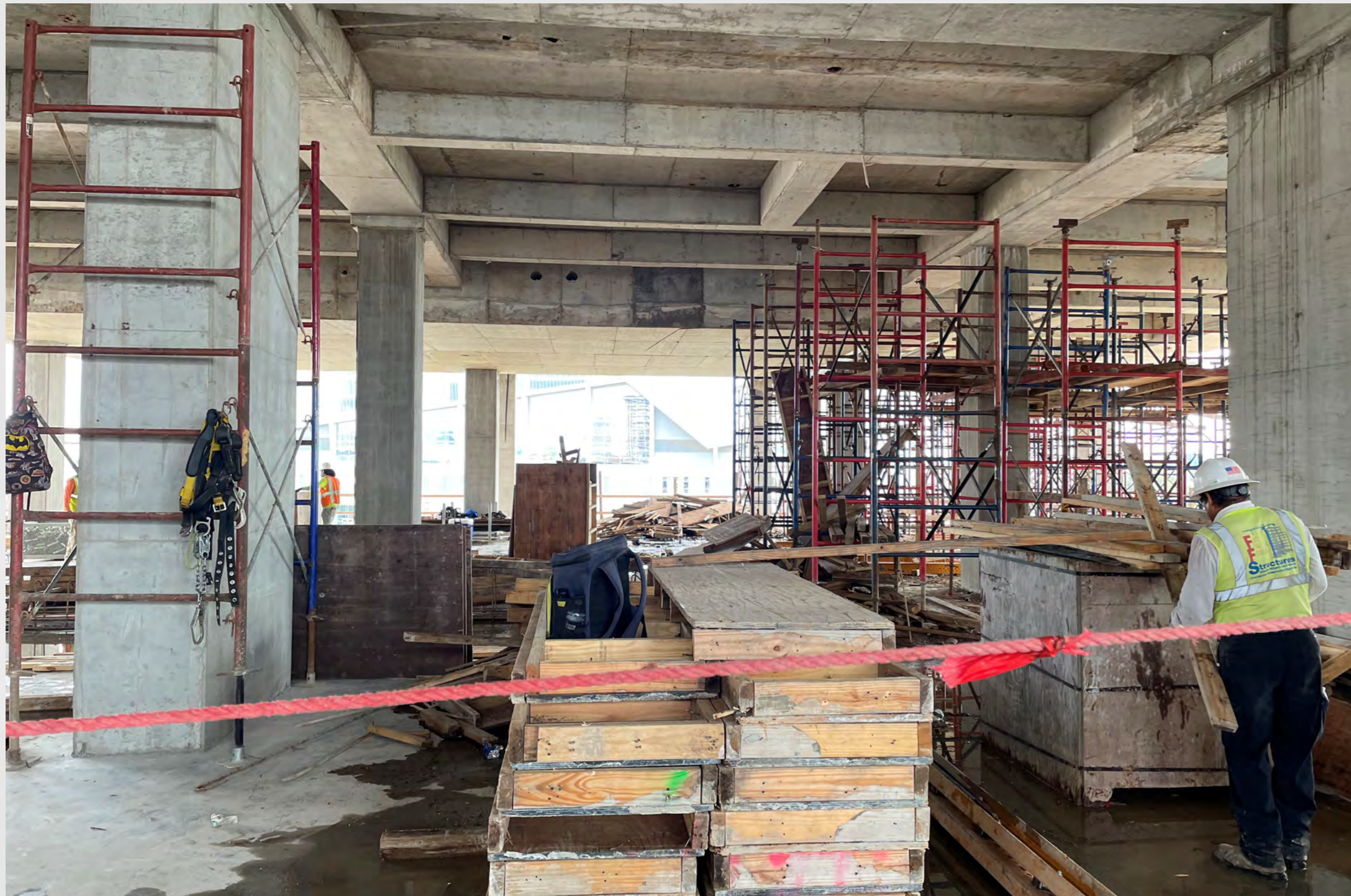
View into Sports Bar