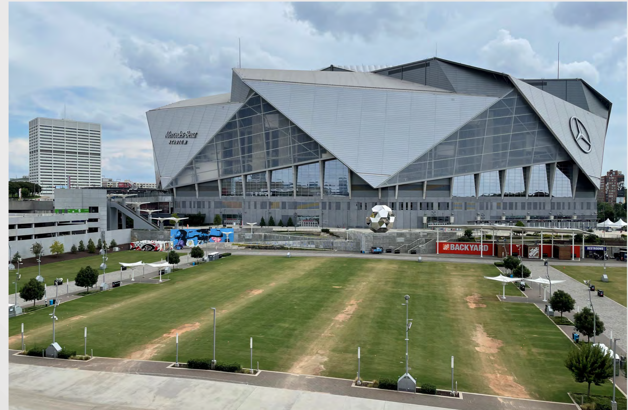
View from Dining Balcony