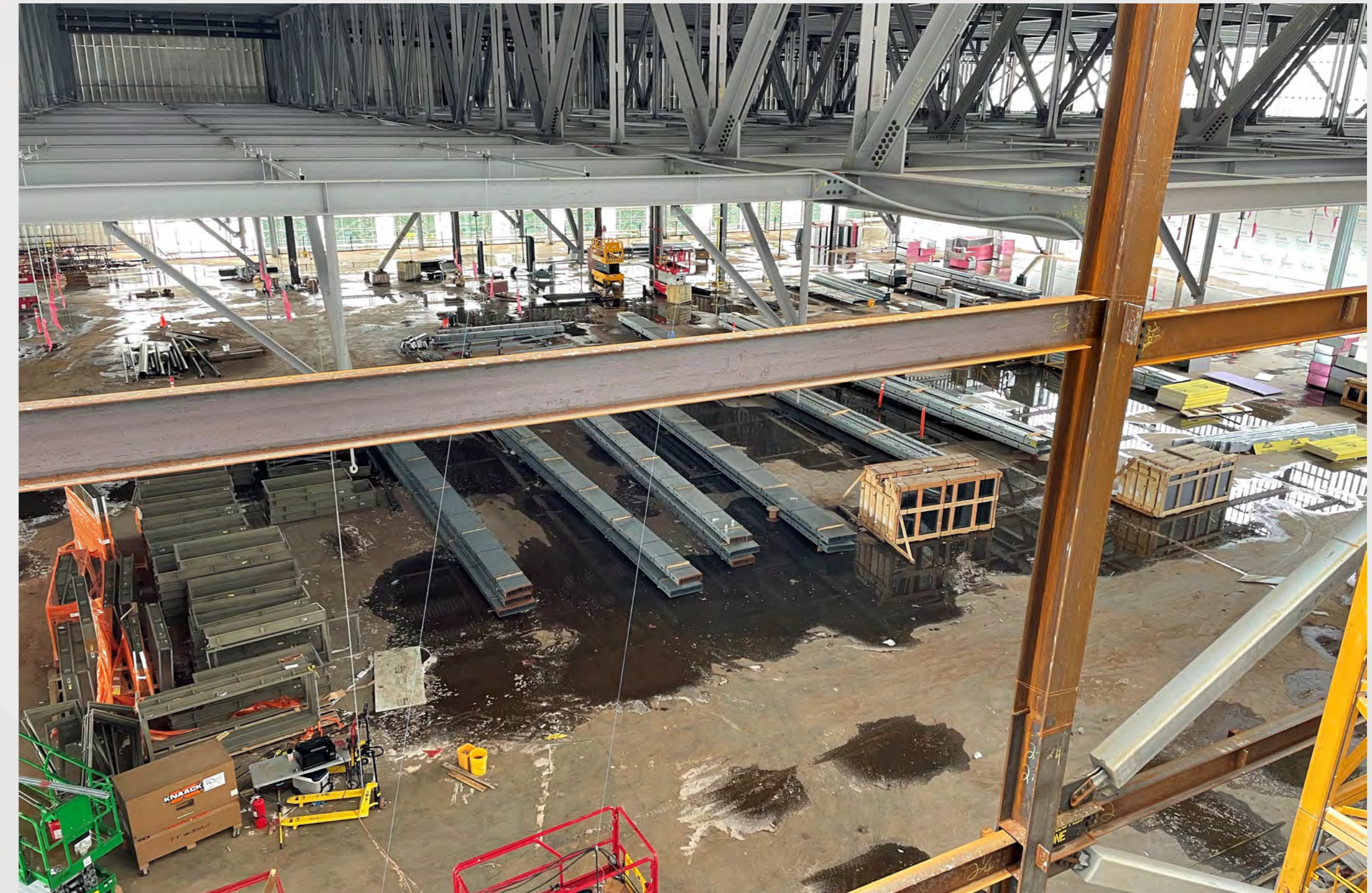
View into Triumph Ballroom