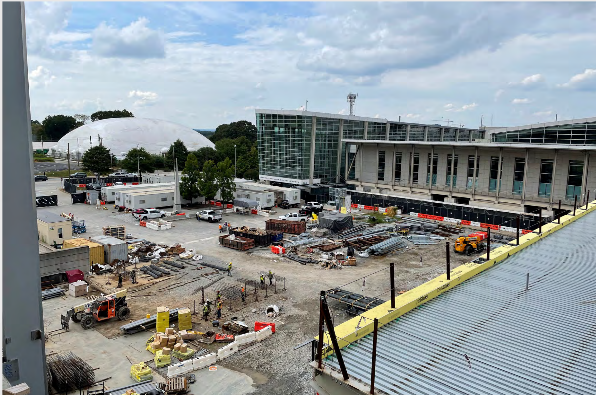
View from Private Dining