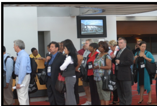
Regis. Hall Monitors (single units)