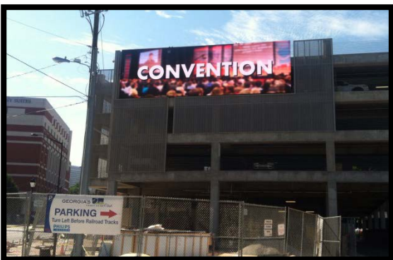
Marietta St. Deck Billboard