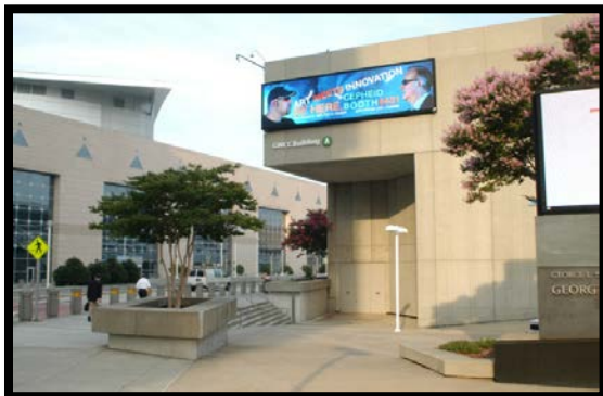
East Plaza Billboard